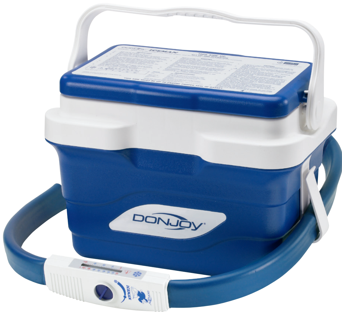
DONJOY® ICEMAN® CLASSIC Cold Therapy Unit