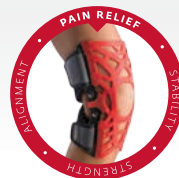
Donjoy REACTION WEB™