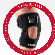
Empi Active™ TENS