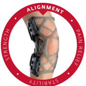
Donjoy OA Reaction Web