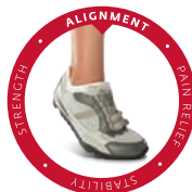
Dr. Comfort Flex OA Shoe